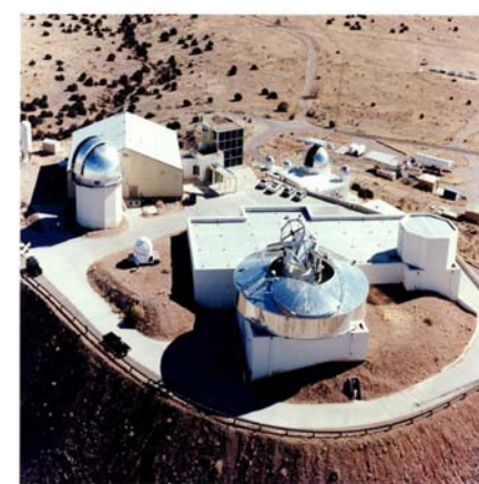
Starfire Optical Range